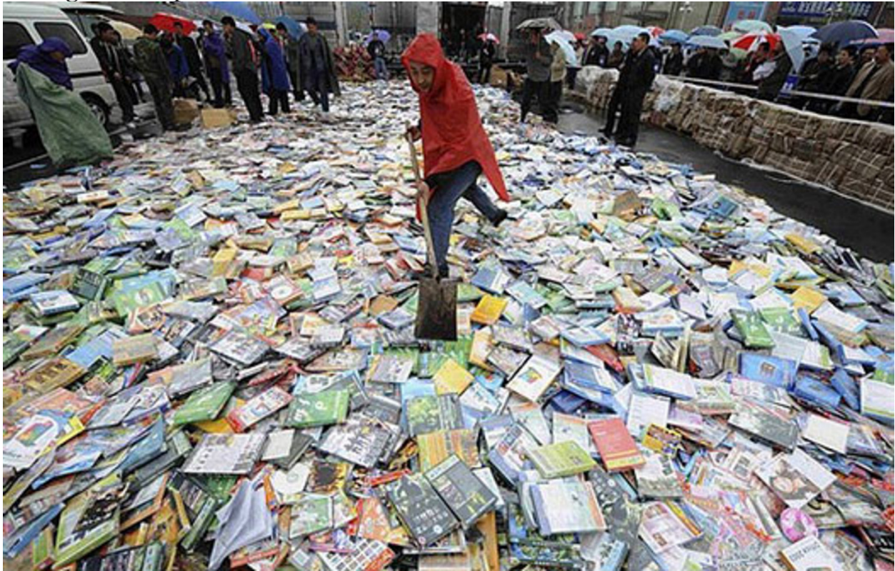
Shoveling pirated DVDs in Taiyuan, Shanxi province, China, April 20, 2008. From here .

images show the rare, the obvious, and the unbelievable—that is, if we can still manage to decipher it.