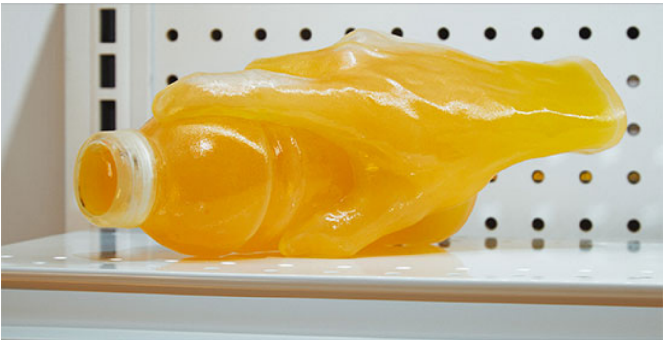
Josh Kline, Tastemaker's Choice , 2012 (detail). Installation view at Fridericianum.